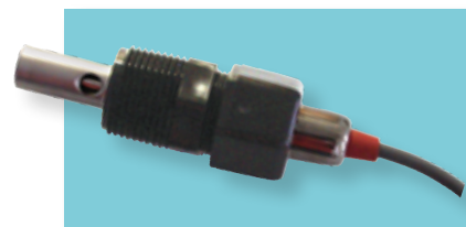
Assembled Resistivity Sensor

The CS10 was designed primarily for use in pure water applications.