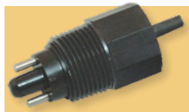
Conductivity Sensor CSA

and range of instrument — up to 20,000 \mu\text{S/ppm} is the normal maximum range of use.