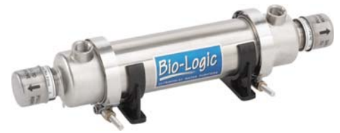
Model BIO-1.5 1.5 GPM

The Bio-Logic® has been carefully conceived to provide adequate germicidal dosage throughout the disinfection chamber.