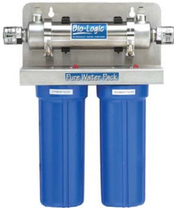
Model BIO-1.5 PWP 1.5 GPM